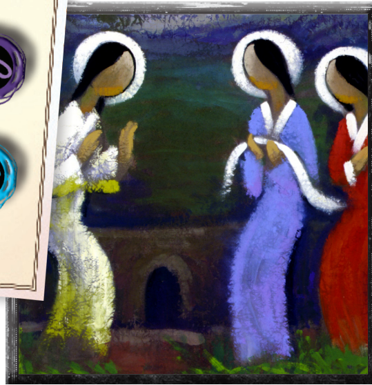
“WOMEN AT TOMB”